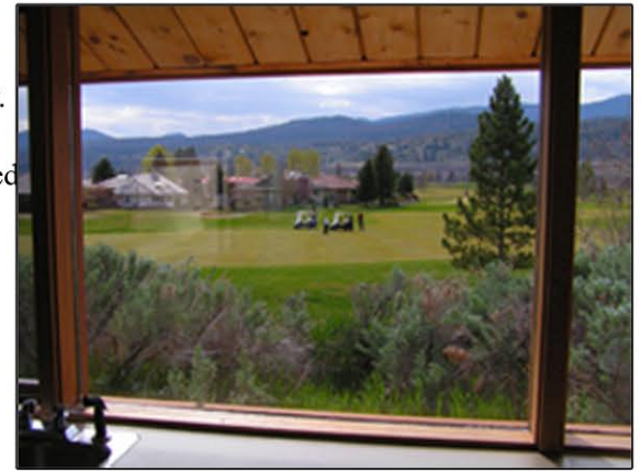
View of golf course from kitchen

Floors - Tile (1 ft square, plain, taupe coloured) with especially-designed red and cream carpets in the lower wing and wool Berber wall-to-wall in the two bedrooms. All carpets/rugs remain.